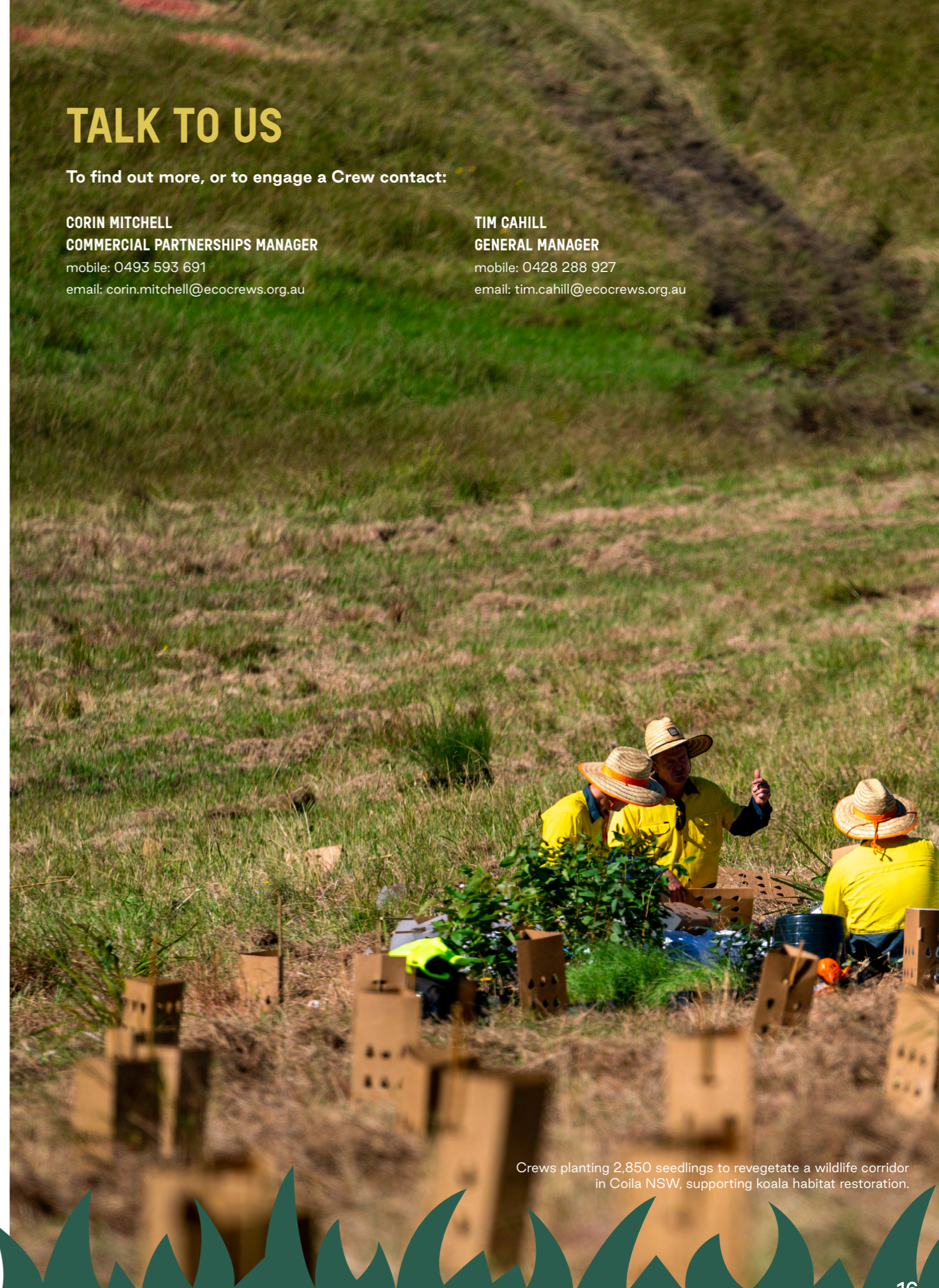
Crews planting 2,850 seedlings to revegetate a wildlife corridor in Coila NSW, supporting koala habitat restoration.

TIM CAHILL GENERAL MANAGER mobile: 0428 288 927 email: tim.cahill@ecocrews.org.au