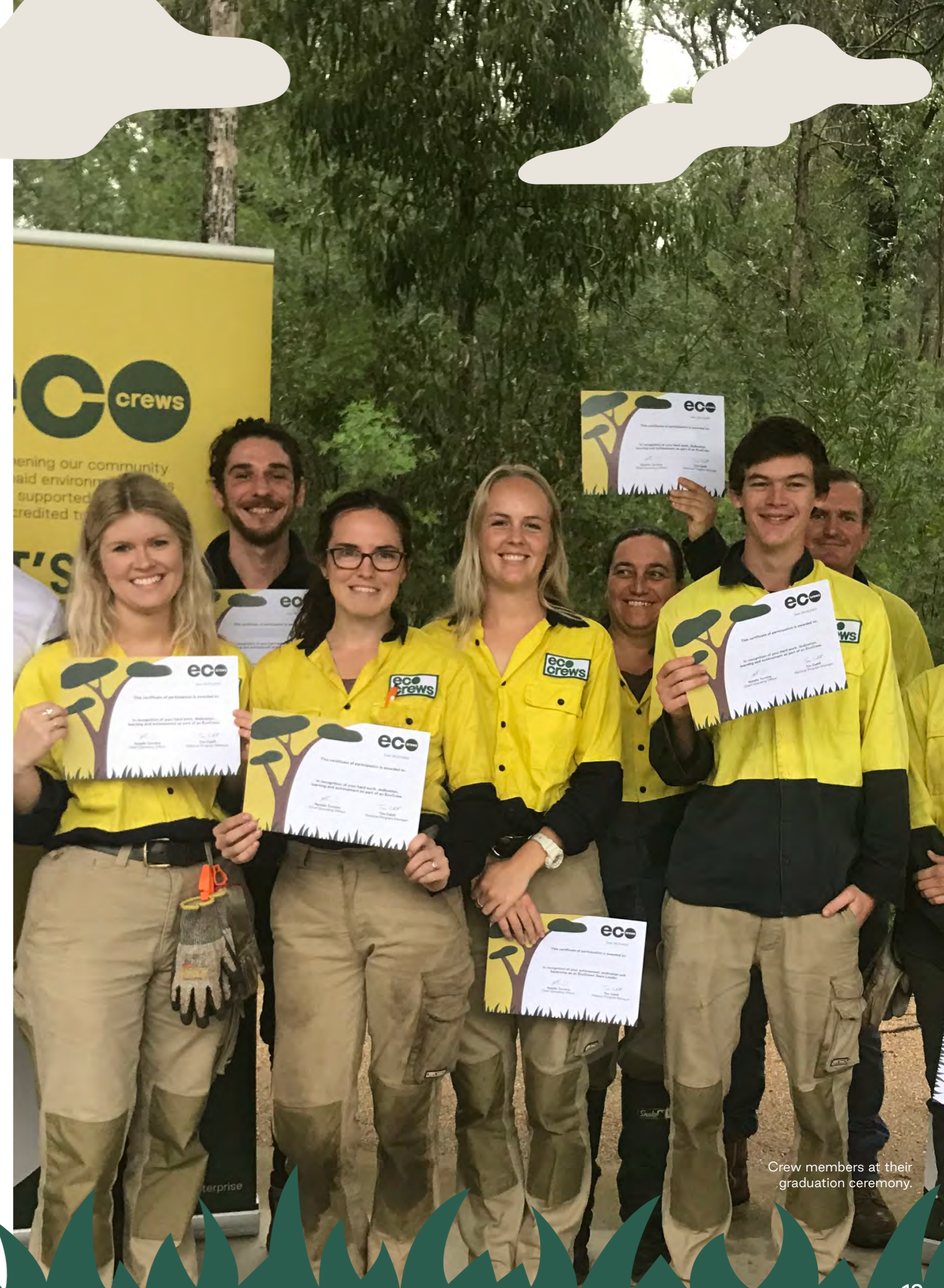
Crew members at their graduation ceremony.